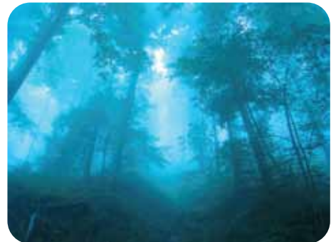
Canada has 397.3 million hectares of forest, other wooded land and other land with tree cover.

More than 53% of Canada’s land is forest, other wooded land and other land with tree cover. The forest products industry is one of Canada’s leading manufacturing sectors and largest net exporter.