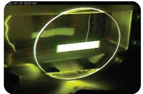
A high-energy beam of synchrotron x-rays illuminates a phosphor screen.

Brazil plans to install Canada's Science Studio platform at its synchrotron, and managers at the Australian synchrotron are evaluating it.